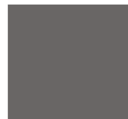
Warm Gray Q933

Additional Stock Colors- High-Opacity White - Q571 Satin Etched - QSatin