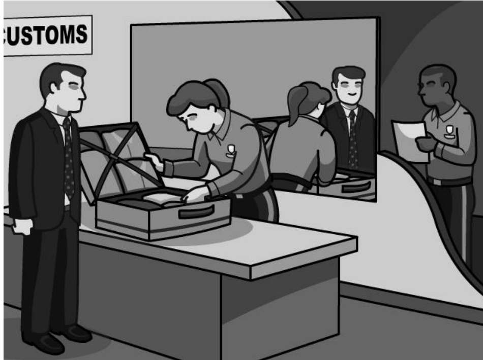
5.1 Airport Security. Baggage Inspection