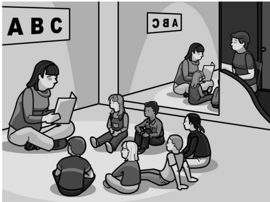
5.2 Day Care Center