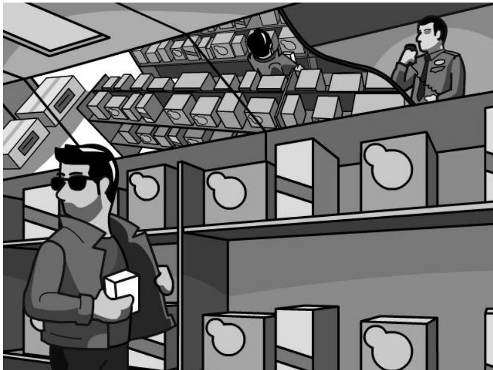
5.4 Retail Store Anti-Theft Monitoring